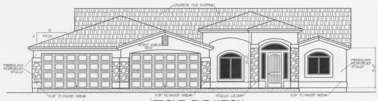
FRONT ELEVATION SCALE 1/4"=1'-0"